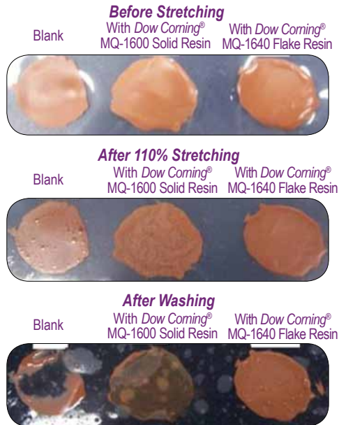
FIGURE 1: Stretching and wash-off resistance of foundation formulations containing 4.25% Dow Corning ® MQ-1600 Solid Resin and Dow Corning ® MQ-1640 Flake Resin

Dow Corning ® MQ-1640 Flake Resin imparts water resistance and rub-off resistance to cosmetic formulations.